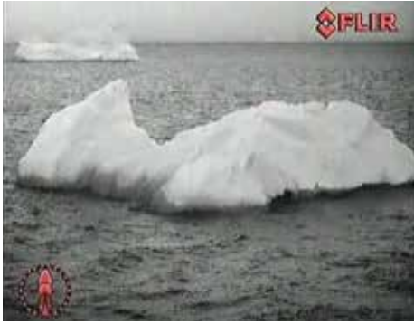
Ice is clearly visible on a thermal image. A thermal image can help the captain to navigate safely in arctic waters.

are even harder to detect by radar. This is particularly true in heavy sea conditions where the radar returns from ice floes may be lost in the so-called 'sea clutter', which means that the waves show up on the radar image, making it difficult to distinguish between ice and the waves.