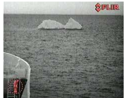
The FLIR M-625XP thermal imaging camera detects ice in total darkness, in practically all weather conditions.

Ice is not always easy to detect in arctic waters. Also not by radar. Smaller pieces