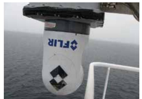
On both vessels the FLIR M-625XP thermal imaging cameras have been mounted in the "ball down" position.