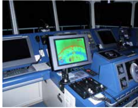
The thermal images from the FLIR M-625XP are displayed on a screen integrated on the bridge.

Prime Ltd., a FLIR distribution partner that operates within the Greek territory, supplied TMS Tankers with two FLIR M-625XP thermal imaging cameras.